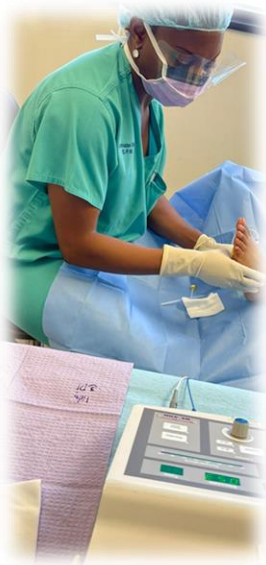
Radiofrequency Nerve Ablation