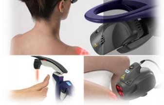
MLS Laser Therapy