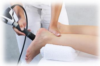
EPAT Shockwave Therapy