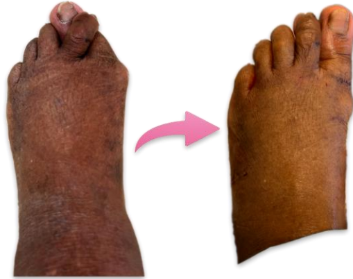
Hammertoe & bunion correction