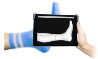
Forward Motion Scan